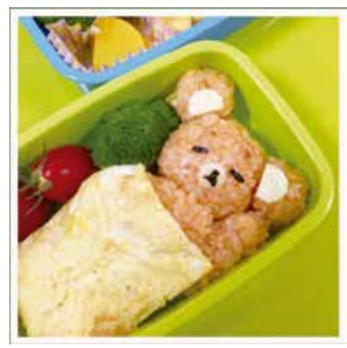
Cooking "character bento"