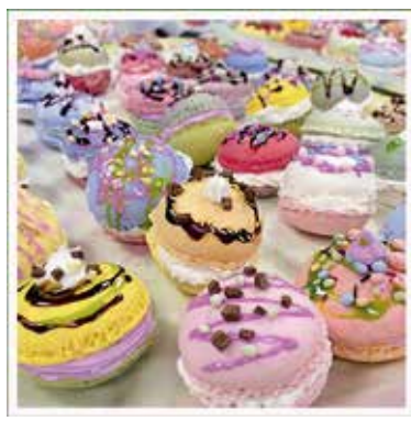
Making "sweets deco"

New Japanese culture, combined with tradition or newly established, is now called "COOL JAPAN" and has become popular worldwide. Experience Japanese "KAWAII culture" through making "sweets deco" or real looking clay sweets and "character bento," a packed lunch now popular even in European countries which is arranged into "characters."